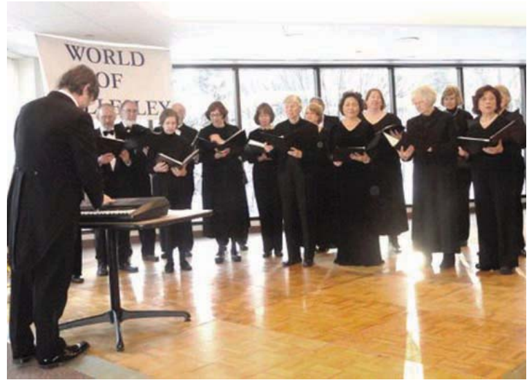
The Wellesley Choral Society will perform on January 18.